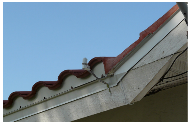
Rain sensor obstructed by roof line (top) should be repositioned (bottom).