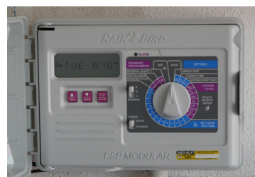
Typical irrigation system clock, with "Rain Sensor" setting.