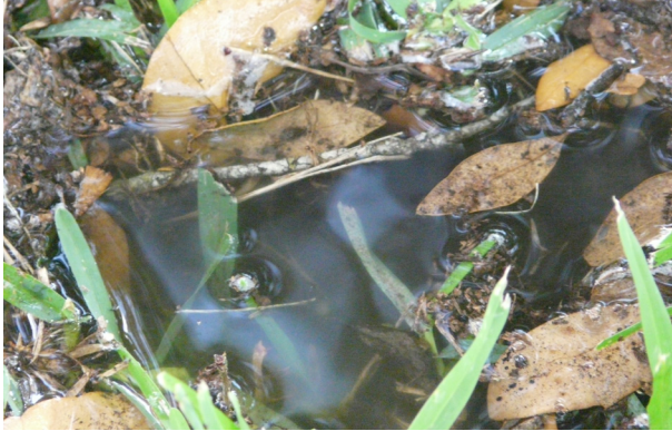
A buried sprinkler head wastes water.