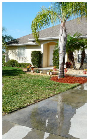
Wet driveways and sidewalks are signs of wasted water. Heads can be adjusted to spray lawn only.