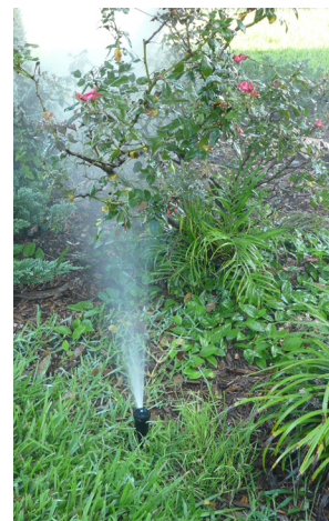
Sprinklers spraying established plants should be moved to the grass or capped.