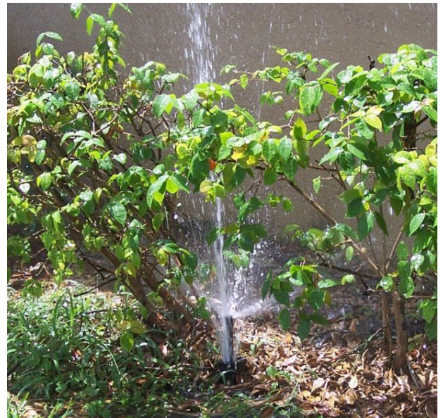
Leak in a sprinkler due to a worn seal.