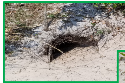
Gopher tortoise burrow (l) and scat.