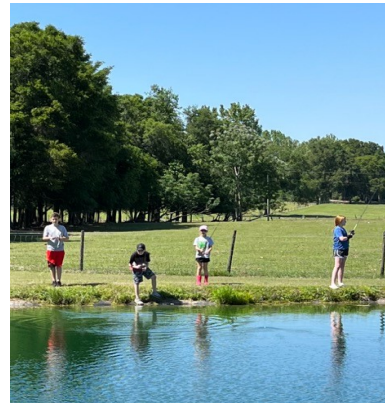
4-H Anglers work together to respect each other's space and not tangle lines.