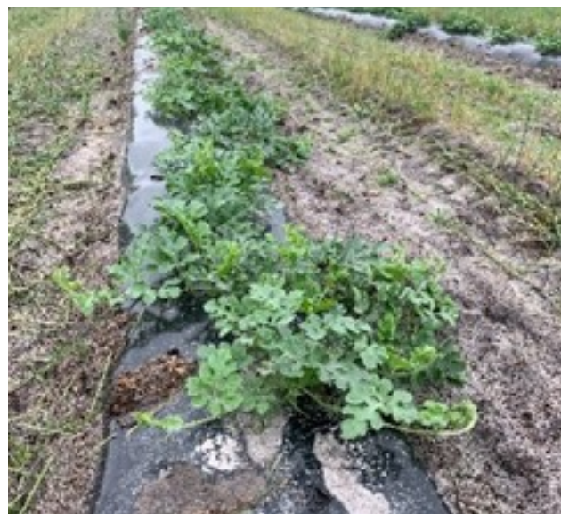
Watermelons being grown in Lafayette County.

esting year as we continue to be impacted by rising production costs. As consumers we should always remember that our producers are facing uncertain times also and already went through a couple of environmental setbacks for the crops this season. Remember to buy local and support our economies as much as possible and be thankful for those who work so hard to keep food in production for us!