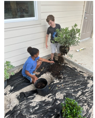
4-H members planting shrubs.