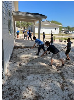
Youth preparing beds at new 4-H Classroom.

The Lafayette Homeschool 4-H Club worked hard this month learning about landscaping. The monthly meeting began with the pledge to the American and 4-H flags. Lafayette Agriculture agent Emily Beach taught the club how to properly transplant potted shrubs and proper placement of shrubs when landscaping. 4-Hers used the knowledge gained to landscape the new 4-H educational building. Shrubs planted included Pittosporum, boxwood, miniature azaleas, and crepe myrtles. The new beds were dressed with pine straw to help maintain moisture.