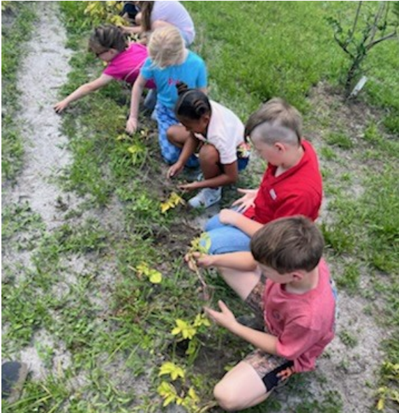
Second graders digging potatoes from the LES Garden.

LES 2 nd Graders were recently able to dig the potatoes they planted a few months prior. The five classes had planted 15-20 pounds of potatoes in February and were able to harvest over 100 pounds which were divided up for the students to take home. They also harvested the remainder of the fall crops still growing in the school garden including celery, turnips, radishes and lettuce.