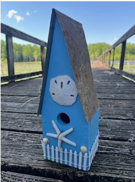
Lanae Colson loves the beach! Can you tell??