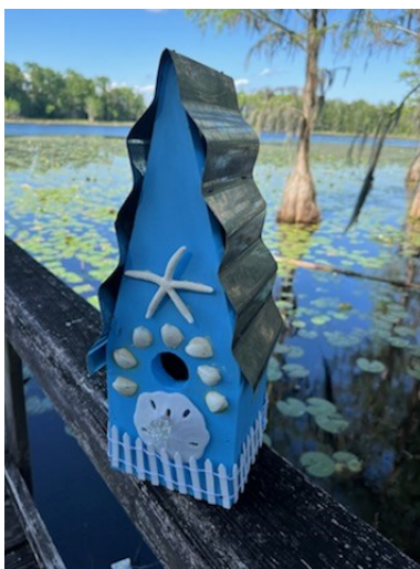
Every bird needs their own beach house! Way to go Tatum Hart!