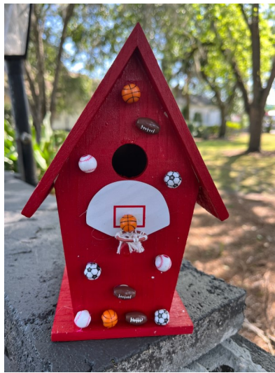
Wyatt Creel is ready to "Play ball"! Any kind of ball.