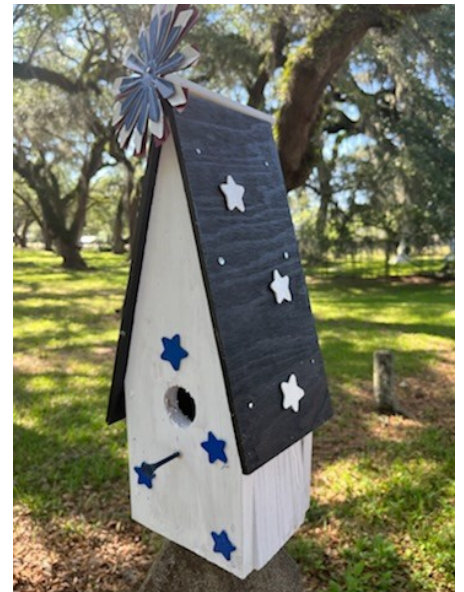
Stars are shining on Parker Gaskins' birdhouse.