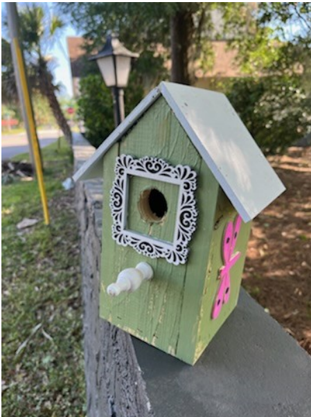
Trevor Moseley insists there are bright pink dragon flies...maybe in Day Town?