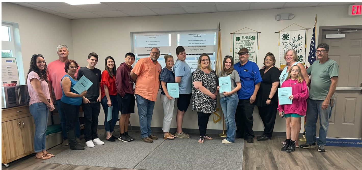
Five families celebrated their completion of the seven week Strengthening Families Program. Contact the extension office to enroll your family in the SFP 10-14 that will be presented again in August and September.

Lafayette County Extension recently completed its first Strengthening Families Program. There were 13 individuals, 5 youth and 8 parents who completed the course which lasted seven weeks. At the end of week seven, the participants were given written post surveys and gave feedback to program facilitators in an informal discussion. All those who participated were in agreement that the program had been very beneficial, interesting and that they were glad they had participated. In fact, they even said they would miss not having the weekly session. The participants who were the caregivers for other youth said they would definitely participate in the program with those youth when they reached the minimum age of 10. The Lafayette County Extension Service will be offering this program again in August. Families with youth ages 10-14 are welcome to participate and should contact the extension to be added to the future participant list.