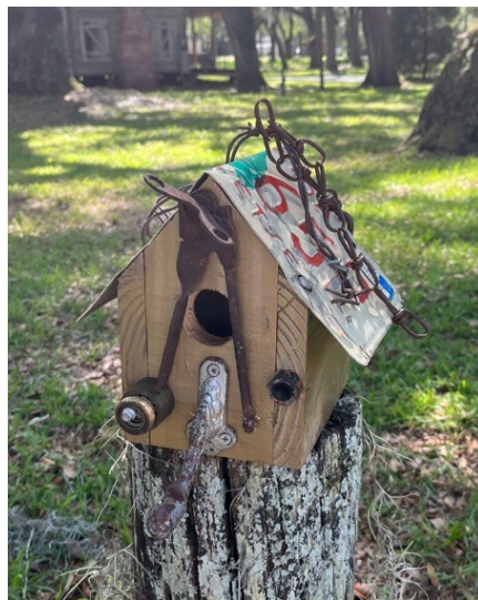
Why you should never throw anything away! Great job Kenly Melland.