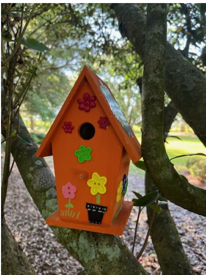
Elias Ballesteros's home is simple but awesome!