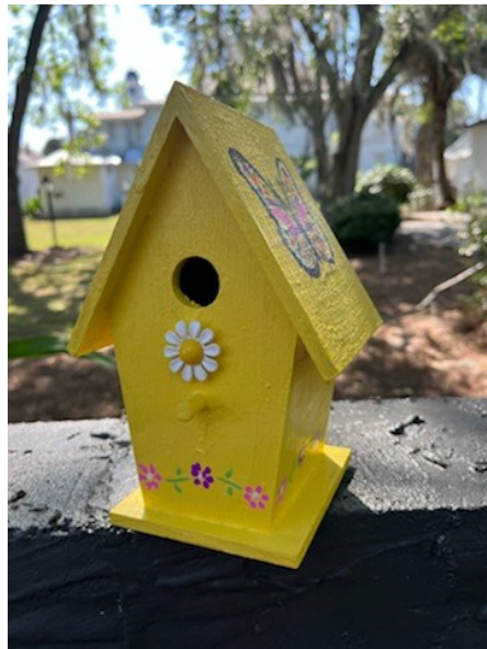
Karoline Beach loves the color yellow and daisies.