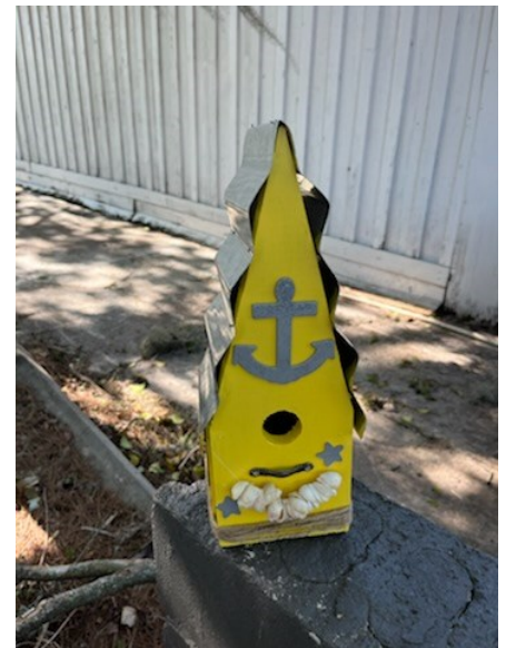
Anchors away! Lets get some birds in Ella Dodson's awesome birdhouse!