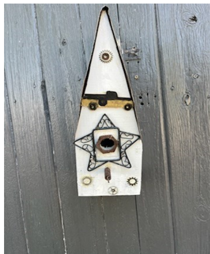
Reese Platt knows what he likes, and one of those things is trucks!