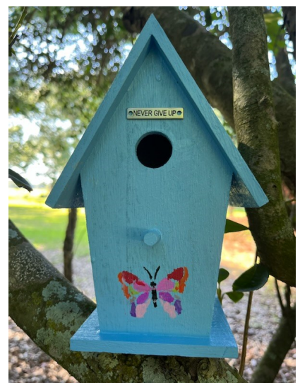
Great advice Ellery Dykes!