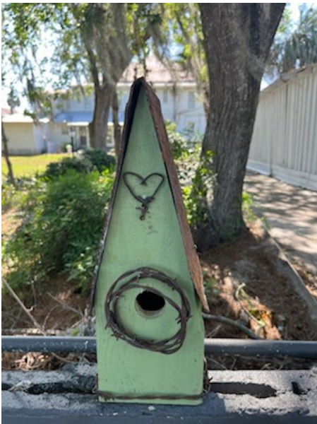
Kurt Sanders was determined to put some barbwire on this bird house...and it looks good!