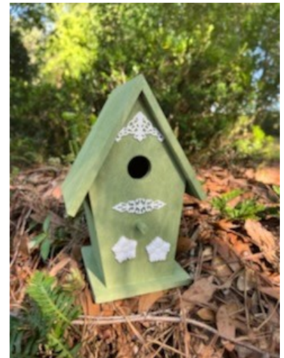
Just a pretty birdhouse trimmed in white. It's very nice Derby Sherrell.