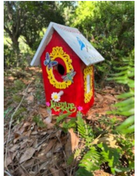
Sophia Burak has built an inspiring birdhouse for sure!