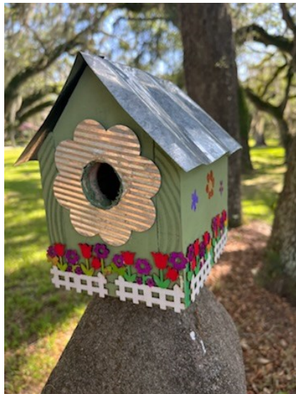
Birds will love hearing the rain drops on the tin roof of Tinley Jackson's birdhouse