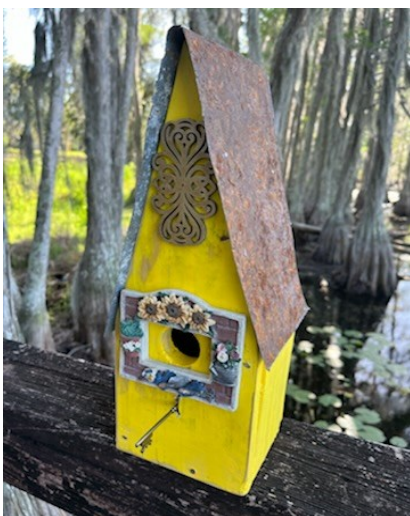
Looking good Brantley Porr!