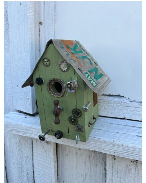
Pablo Ballesteros has a big heart and wants the birds to have plenty of things for them to play with.