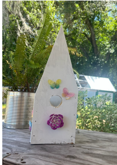
Rylie Creel has made a beautiful birdhouse with roses and butterflies.