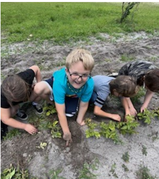
The feel of finding your first potato!