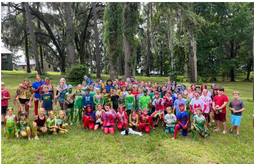
Top Clockwise: Tri-county campers learn safety and shooting skills with air rifles. Youth from Mayo prepare for a marshmallow paint war. Youth enjoy kayaking on Cherry Lake. Tri-county campers covered with bright colored paint after the annual marshmallow paint war.