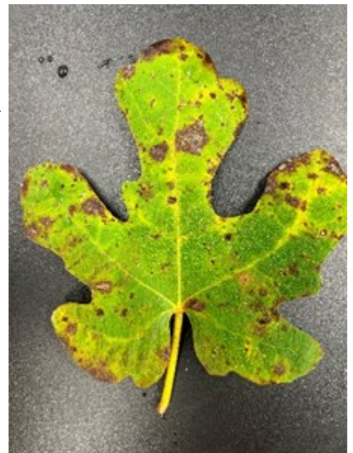
A fig leaf from a Lafayette County resident's tree showing leaf spot.