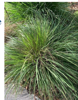
Lemon Grass

Native grasses bloom differently from what we usually think of a flower bloom. Most send up stalks that become a plume above the height of the grass clump. Elliott's Lovegrass ( Eragrostis elliottii ) plumes are a light oat color and remind one of an optic light show. Lopsided Indian Grass ( Sorghastrum secundum ) has a reddish plume that gets seeds just on one side of the plume. A crowd favorite, Muhly Grass ( Muhlenbergia capillaris ), sends up a lovely pinkish bloom.