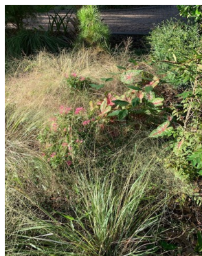
Lopsided Indian Grass

Many grasses bloom in the fall, and the blooms will last through the winter. So even if grasses are looking a bit brown, do not trim them or cut them down.