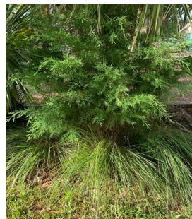
Fakahatchee Grass

spring green color. Lemon Grass is also used as a tea and an herb.