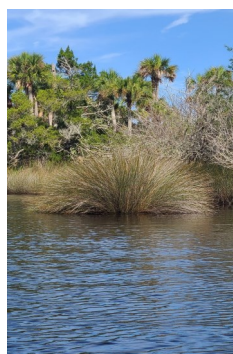
Cord Grass

Native grasses bloom differently from what we usually think of a flower bloom. Most send up stalks that become a plume above the height of the grass clump. Elliott's Lovegrass ( Eragrostis elliottii ) plumes are a light oat color and remind one of an optic light show. Lopsided Indian Grass ( Sorghastrum secundum ) has a reddish plume that gets seeds just on one side of the plume. A crowd favorite, Muhly Grass ( Muhlenbergia capillaris ), sends up a lovely pinkish bloom.