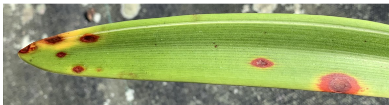
Red blotch disease on Amaryllis

A disease known as red blotch occasionally infects bulbs such as amaryllis and crinum and is more commonly seen on shaded plants that are frequently irrigated. Leaves and flower stalks that push up from infected bulbs may also become diseased, showing red spots that elongate and become sunken. Severely infected bulbs should be discarded. Management includes removing diseased foliage, eliminating overhead irrigation, and relocating to a sunnier area as appropriate. Additional options may include fungicide (thiophanate methyl) applications or hot water treatments in which infected bulb scales are removed and bulbs are soaked in water of 104-114°F for 30 minutes.