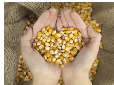
Corn can be shelled with a hand sheller or electric shellers can be purchased.

Corn could be shelled and stored, or stored on the ear and fed out whole. It is important that corn is stored in a dry spot, whether this be an enclosed storage barn, semi trailers, or another way. Every acre of corn can produce at least 500 lbs of shelled corn. Tighter row spacing and lower moisture levels will equate to more pounds of corn, well planned plots can produce 1500 or more pounds of shelled corn per acre.