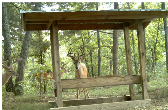
Open feeders can be used to feed whole ears or shelled corn.

Although shelled corn isn't very expensive per bag, over the entire hunting season it can add up to an expensive deer attractant. Do you plant wildlife plots in the fall to attract deer to your stands? Why not plant corn in the summer to harvest yourself in order to keep your feeders full all season?