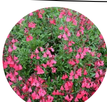
Autumn Sage (Red & Pink)