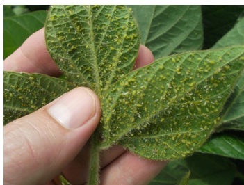
Aphids hiding on the underside of a leaf.