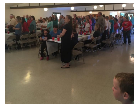
Everyone at the auction getting ready to say the pledges!