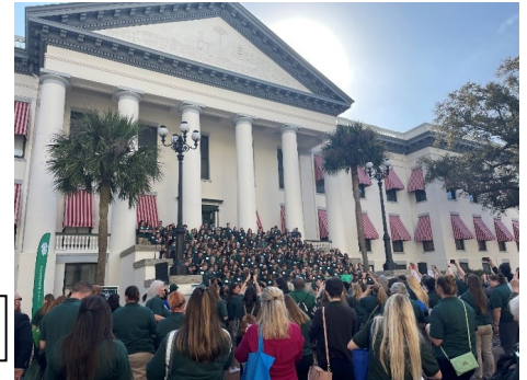
Florida 4-H Day at the Capital